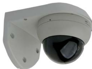
MVCHWB Wall Mount Bracket