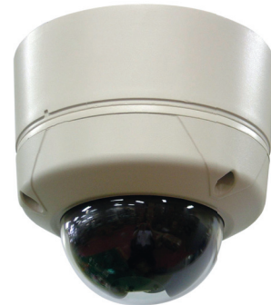
Flush, Surface Mount